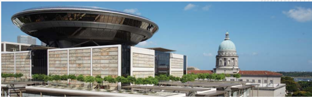
Supreme Court of Singapore

For more information on the hotel, please call +65 6845 1188 or visit www.meritus-hotels.com